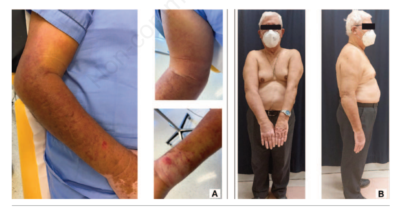
Figure 2. A) Patient's right arm. Note the arm size, which was more than twice the contralateral, causing the patient difficulties in flexing the arm and swelling, with the appearance of orange peel skin; B) patient after six months of treatment with methotrexate and the use of the elastic compression device. Note the significant reduction in the volume of the affected arm and the skin appearance, now much more similar than the unaffected one.